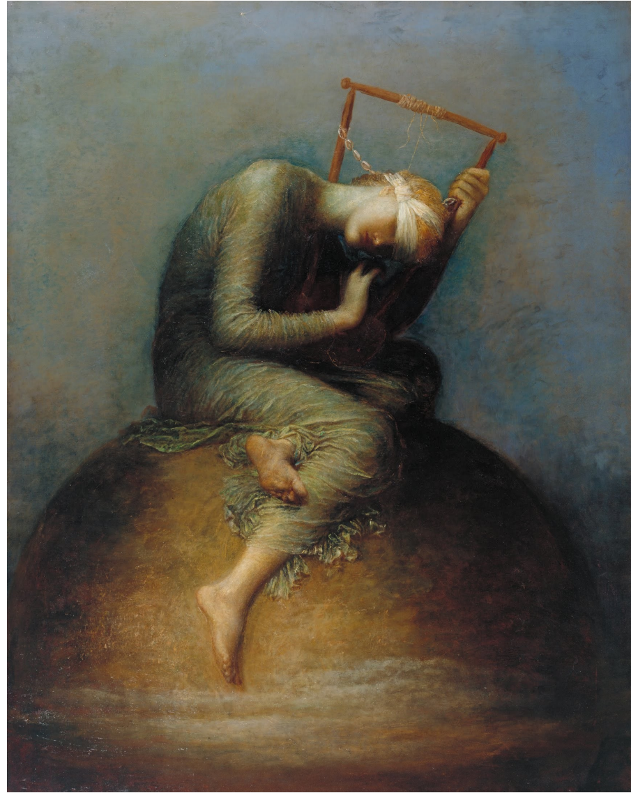
"Hope" by George Frederick Watts, 1886