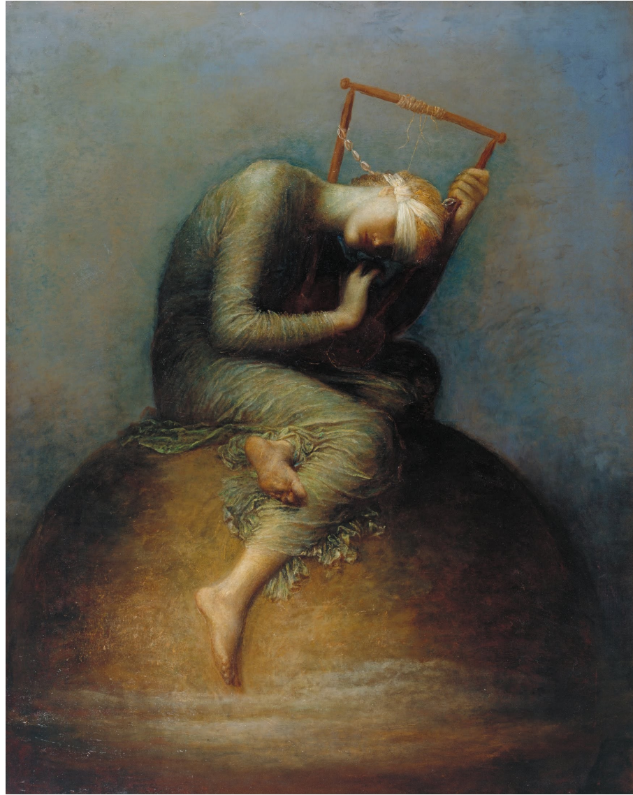
"Hope" by George Frederick Watts, 1886